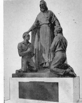
Aaronic Priesthood Restored 15 May 1829 By John the Baptist JOSEPH SMITH OLIVER COWDERY

Chosen and Ordained By Jesus Christ Who was sent of God (John 15:16)