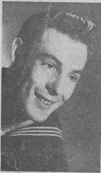
Richard C. Cheney