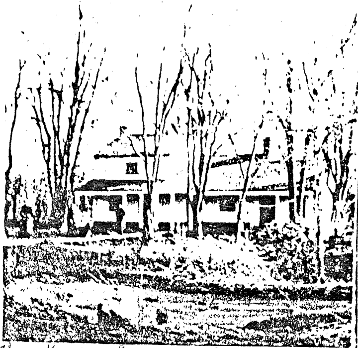
The John Neff Home in Penn.